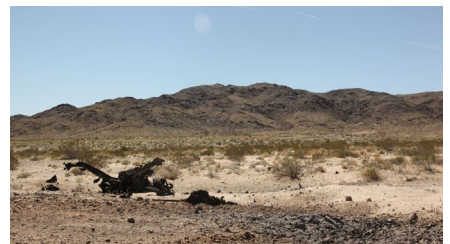
MCAGCC 29 Palms' desert terrain provides an ideal pre-deployment training environment (top), including post-blast investigation of improvised explosive devices (IEDs, bottom).